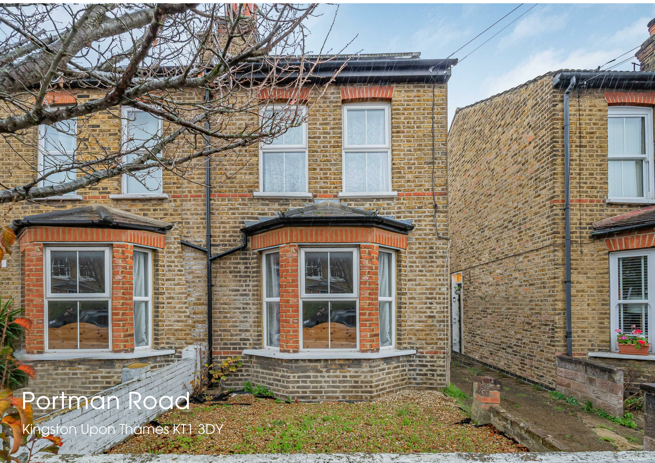
Portman Road Kingston Upon Thames KT1 3DY